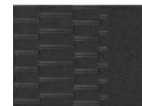
Black (HIGH grade)