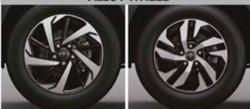
17 inch 6.5J (HIGH grade)