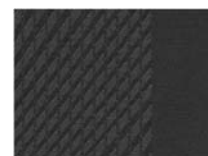
Black (MID grade)